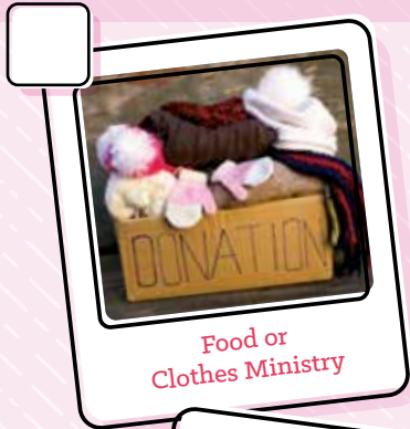
Food or Clothes Ministry

Place a check mark beside the ways your church helps people. Write other ministries your church provides in the blanks below.