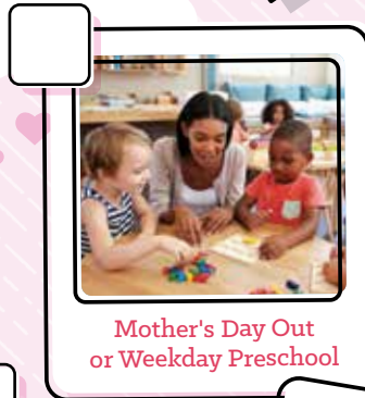
Mother's Day Out or Weekday Preschool